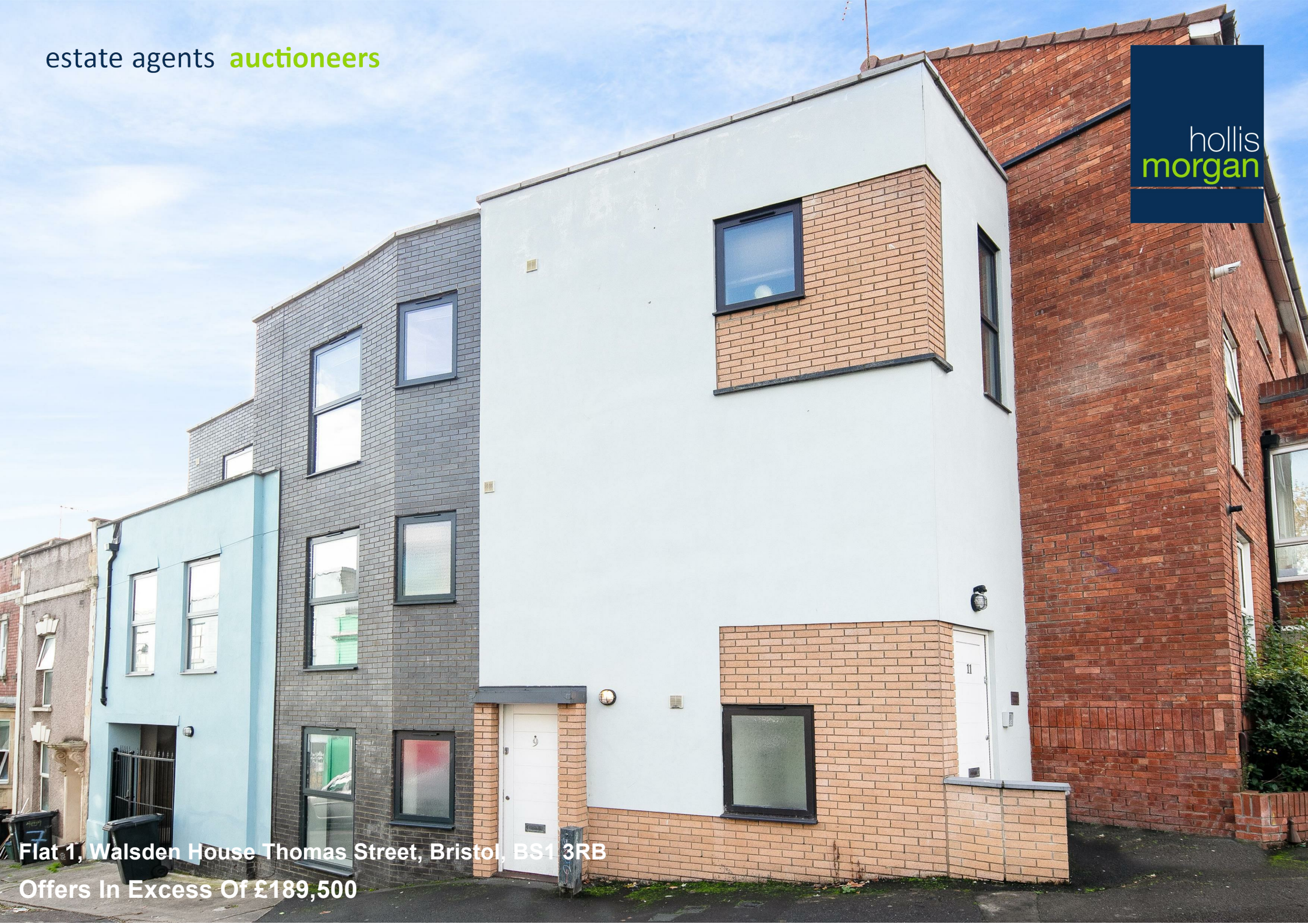
Flat 1, Walsden House Thomas Street, Bristol, BS1 3RB